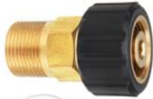
Male M22/ 15mm x Female M22/ 14mm