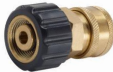
Female M22/ 14mm x female 3/8" Quick Connect

Another type of pressure washer hose end fitting is a Male 3/8" NPT. The connections for this type is shown below.