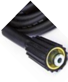
Female M22/ 15mm