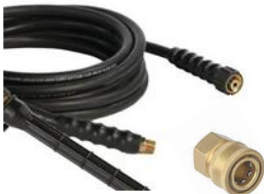
Male 3/8" NPT

Another type of pressure washer hose end fitting is a Male 3/8" NPT. The connections for this type is shown below.