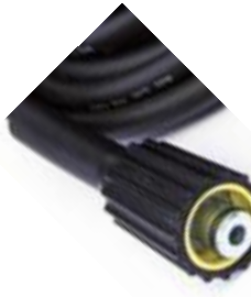
Female M22/ 15mm

Another means of connecting a Female M22/15mm to a female 3/8" Quick Connect is shown below.